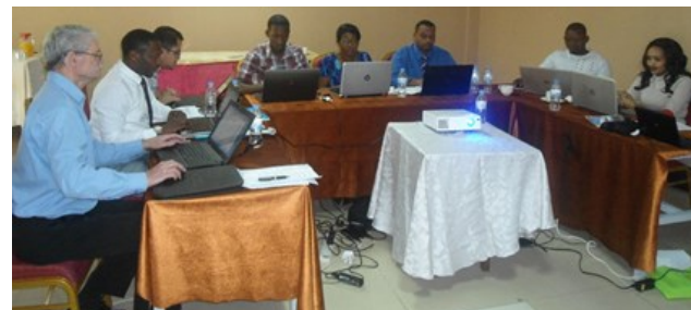
Educators in session