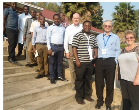
Assessor group at RCBT-Karongi, Western Rwanda